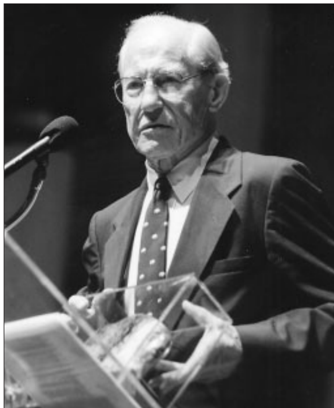
The late Byron White addresses the crowd at the inaugural Hall-of-Fame gala.