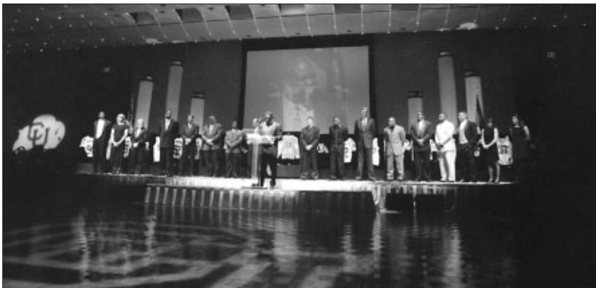
The first group of 20 to have their jerseys honored.