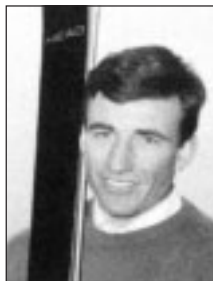
Jimmie Heuga Skiing (1961-63)