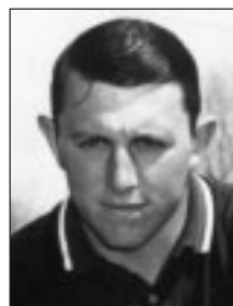
Hale Irwin Golf/Football (1964-67)